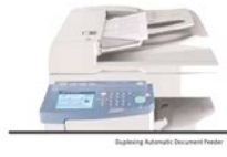
Duplexing Automatic Document Feeder